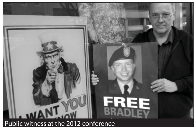
Public witness at the 2012 conference