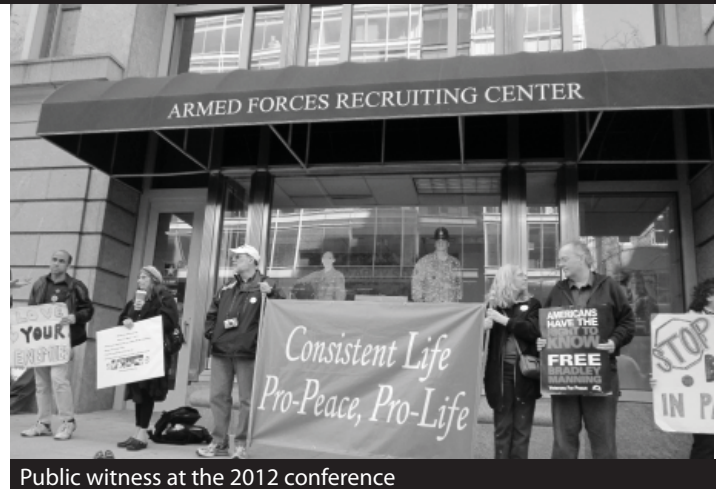
Public witness at the 2012 conference